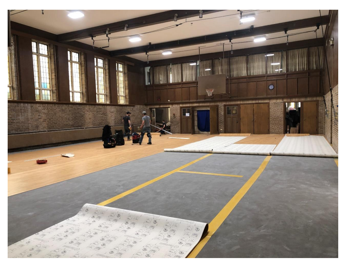
Here is the gymnasium with the new floor and new ceiling. Lighting and lines on the gym floor are presently being applied.