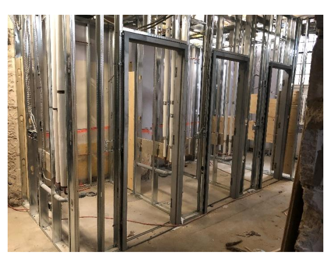
Fondly known as "Bob's Office," this Awesome Sale storage room beside the Auditorium is being prepared for the installation of 4 new gender-neutral washrooms.