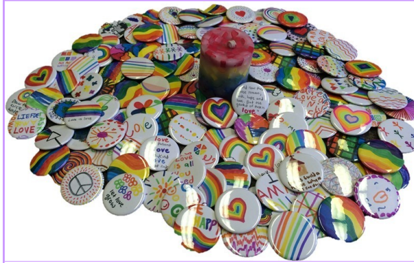
Buttons created by LUC Children and Youth for Affirming Celebration, April 24, 2016.